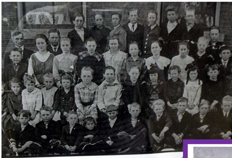
Wendt's School 1917

Wendt's School-1917 This was a 1 room school.