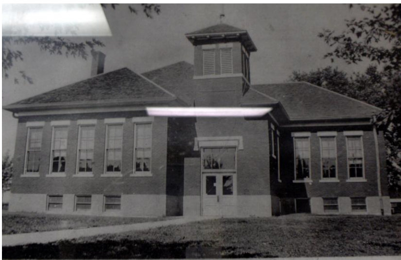
Alma Public School - 1922

A glimpse back to our Alma Schools many years ago!