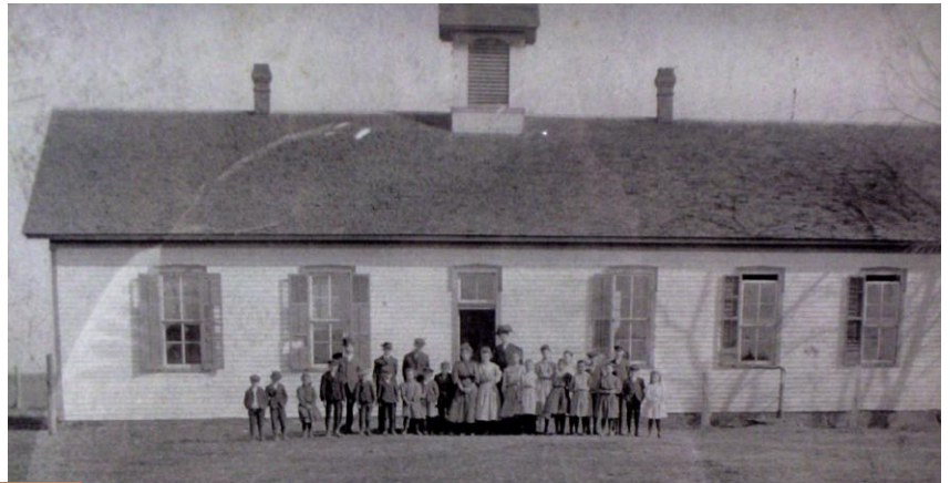
Public School Alma Mo.